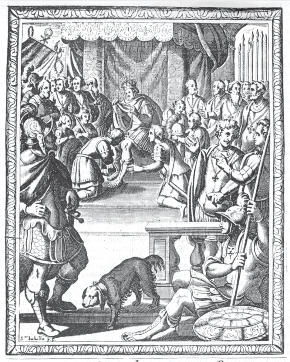
CONSTANTINUS MAX: IMPERATOR, POSTQUAM MUNDATUS À LEPRA PER MEDIUM BAPTISMATIS, MILITES, SIVE EQUITES DEAUREATOS CREAT IN TUTELLAM CHRISTIANI NOMINIS.